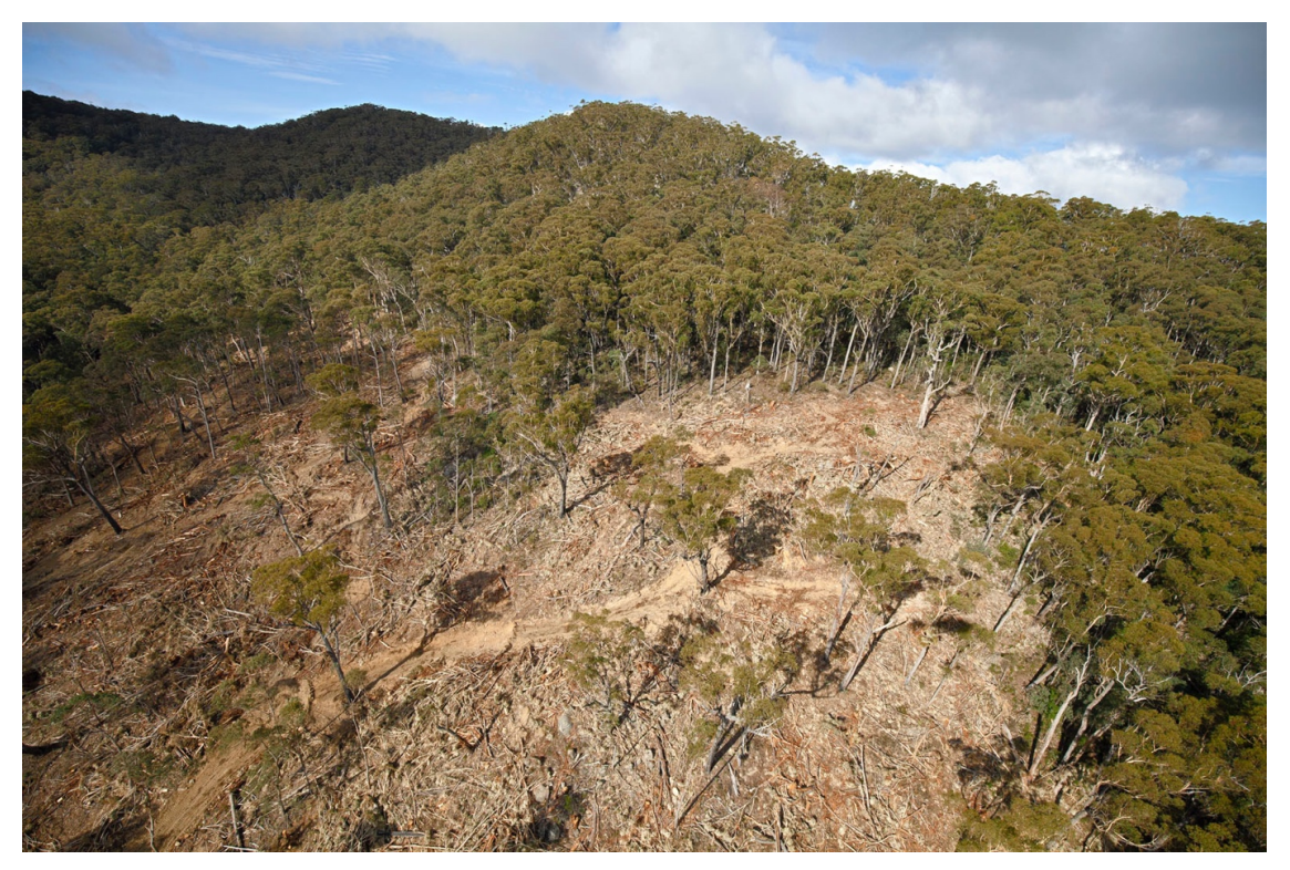
Logged Glenbog State Forest, 2016: photograph, the late Carolyn Green